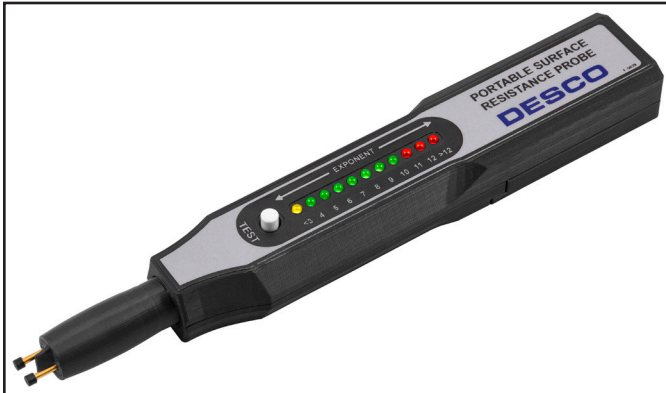
Figure 1. Desco 19301 Portable Surface Resistance Probe