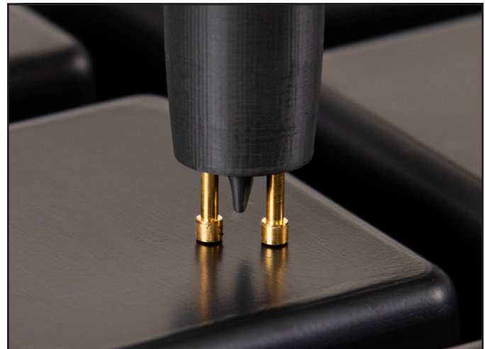
Figure 2. Orienting the spring-loaded pins onto the material to be tested