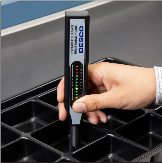
Figure 4. Using the Portable Surface Resistance Probe