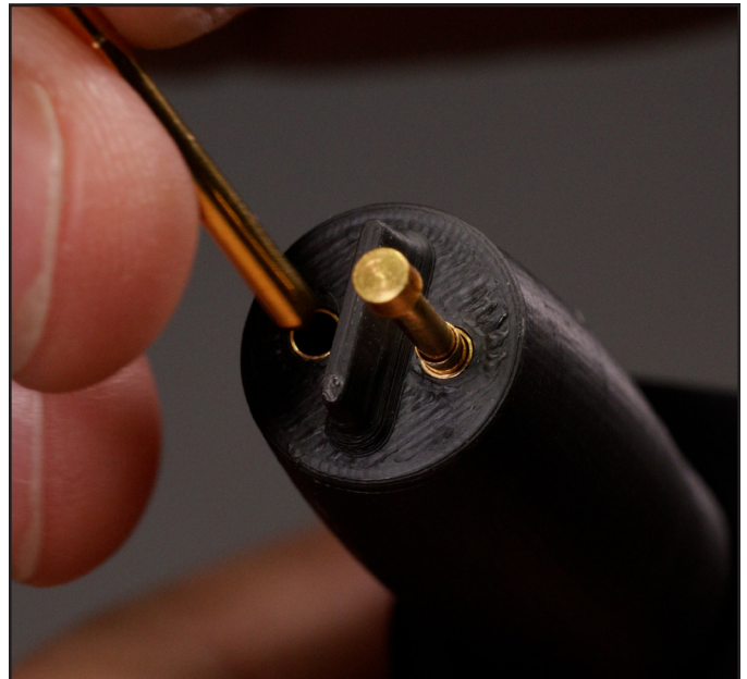
Figure 5. Replacing the spring-loaded pins

Two replacement pins are included should the ones installed in the probe become bent or damaged. Simply pull out the damaged pins from probe by hand and insert the replacements. Compress the pins into their sockets until they are level with one another.