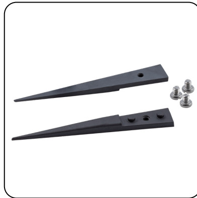
Replacement Tips Only: 71-ZJK-RT Kit of 2 Ceramic Tips and 3 screws